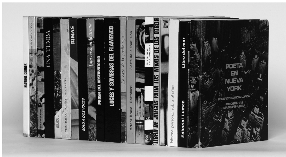
Palabra e Imagen (Word and Image). Barcelona: Lumen, 1961–1975. Collection of the Museo Nacional Centro de Arte Reina Sofía (Library and Documentation Center).